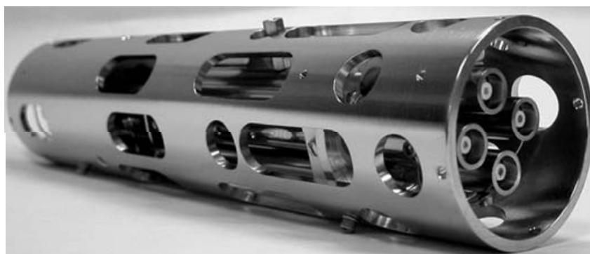
Figure 1: 9.5 mm Quadrupole Mass Filter with Vented Housing shown without Entrance and Exit Lenses

The information in Table 1 and Table 2 should be used as a guide for choosing the mass filter for your application.