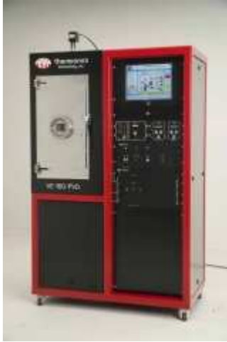
PVD 160 Unit