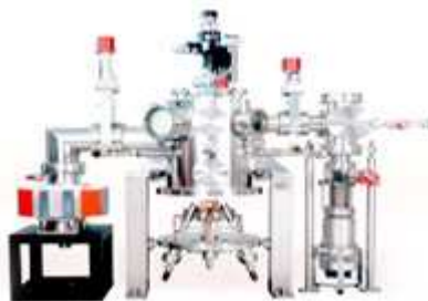
Thin Film Deposition System