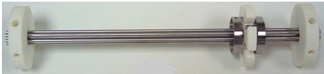
Figure 1 : Hexapole Ion Guide

The different Ion Guides are only a few of a number of unique, high precision MS/MS components built by Extrel. If you would like more information or a complete list of all our products, ask for Product Note GP-110 or contact your local Extrel Representative.